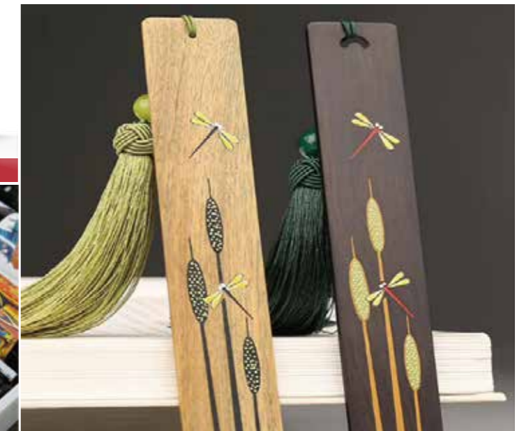
For any kinds of flat material