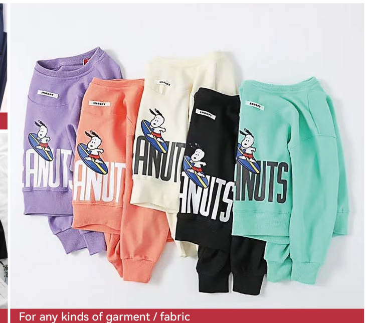
For any kinds of garment / fabric