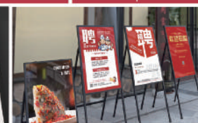
Roll up Banner