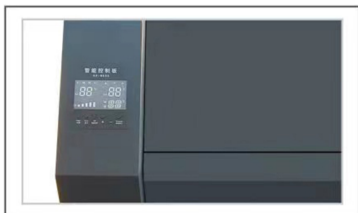
Front,platform,rear, Triple intelligent temperature control system