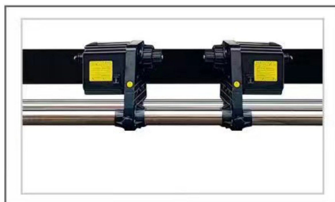
30R High speed feeding and take up system